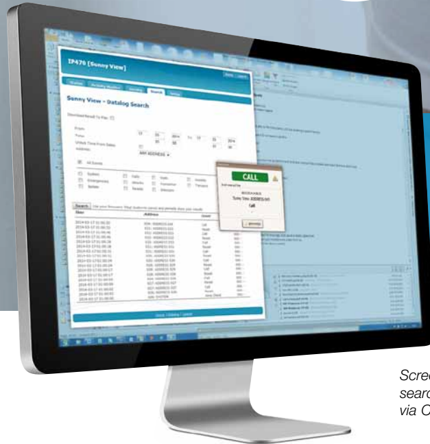
Screen shot shows the embedded IP470 search screen, with a pop up alert generated via CMS/IP software for an incoming call.

A fundamental design principle behind the IP470 is to provide embedded data logging to existing systems without interfering with the existing wiring.