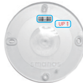
Back Cover (Mounting Base)