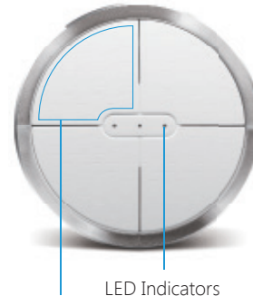
LED Indicators Four Non-numeric Keys *