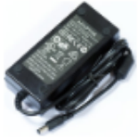
24V 2.5A power adapter