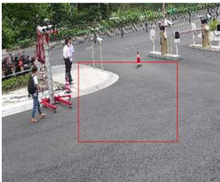
Figure 6-1 Set Rules