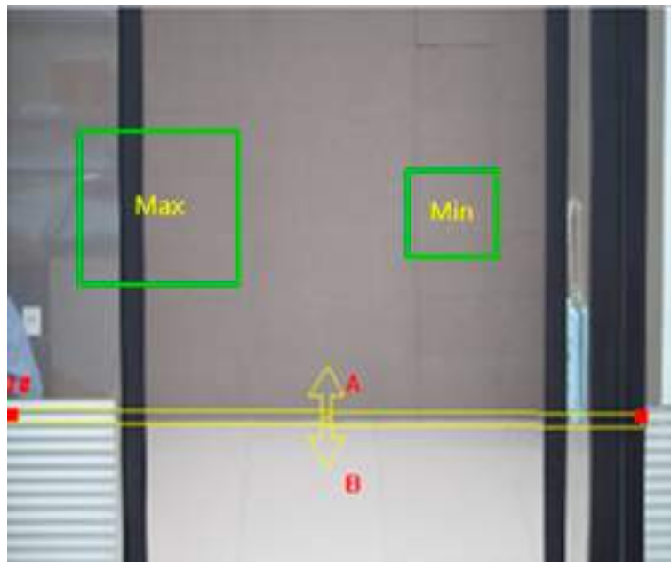
Figure 6-4 Set Rule

Target Validity If you set a higher validity, the required target features should be more obvious, and the alarm accuracy would be higher. The target with less obvious features would be missing.