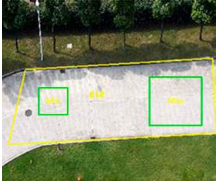
Figure 6-3 Set Rule

If you set a higher validity, the required target features should be more obvious, and the alarm accuracy would be higher. The target with less obvious features would be missing.