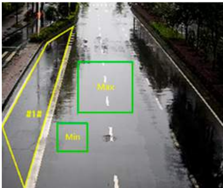
Figure 6-6 Set Rule

Target Validity If you set a higher validity, the required target features should be more obvious, and the alarm accuracy would be higher. The target with less obvious features would be missing.