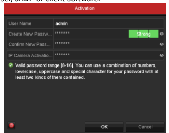
Figure 3-1 Set Admin Password

STRONG PASSWORD RECOMMENDED—We highly recommend you create a strong password of your own choosing (Using a minimum of 8 characters, including at least three of the following categories: upper case letters, lower case letters, numbers, and special characters.) in order to increase the security of your product. And we recommend you reset your password regularly, especially in the high security system, resetting the password monthly or weekly can better protect your product.