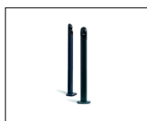
CFT501 Pair of column H 1000 for photocells series R90.