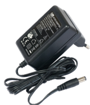
24V 0.8A power adapter