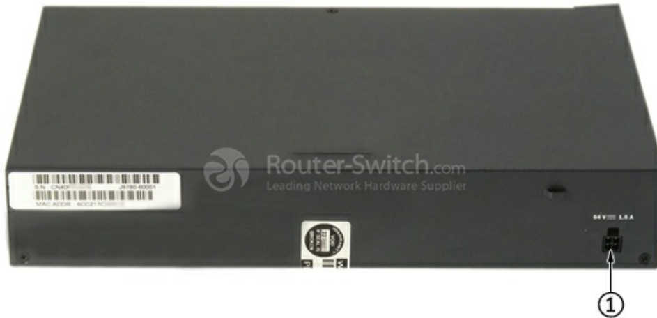
Figure 3 shows the back panel of Aruba J9783A.