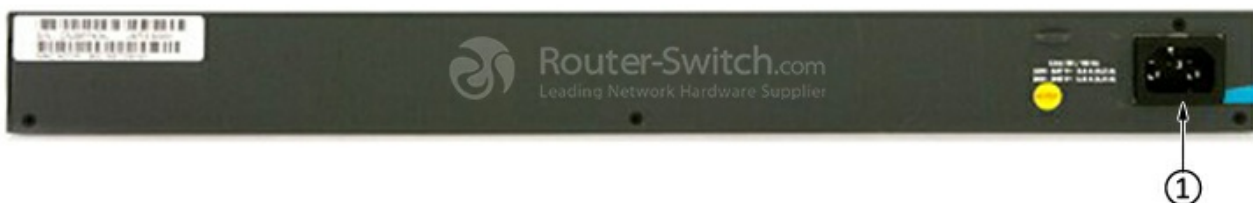
Figure 3 shows the back panel of Aruba J9775A.