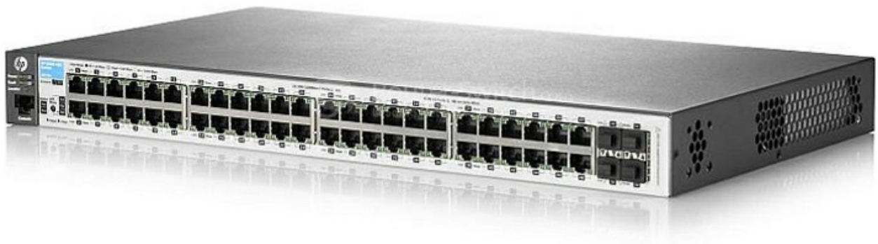
Table 1 shows the quick spec.

Figure 1 shows the appearance of Aruba J9775A.