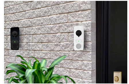
DB7 angle mount bracket