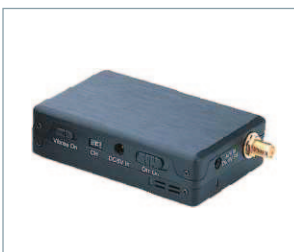
TB-2430 Portable Sender