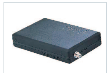
RX-1280B Portable Receiver