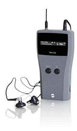
PRO-SL8 with earphones