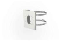
DS-1275ZJ-S-SUS Vertical Pole Mount