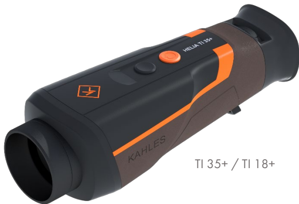
TI 35+ / TI 18+